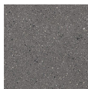
Pddb54515 LRV: 12