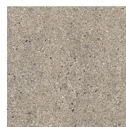
Pddb54517 LRV: 30