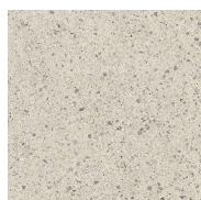
Pddb54513 LRV: 54