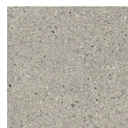
Pddb54516 LRV: 35