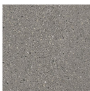
Pddb54514 LRV: 20