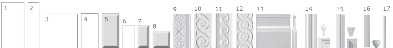
ADE0624 LRV: 54